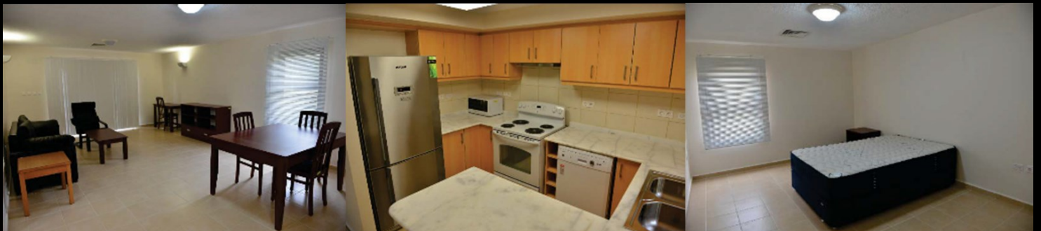
Example of SNCO/Civilian Housing

Show variety and availability may be limited due to geographical location. A virtual private network (VPN) service is recommended to access U.S. programming. Some work better than others so talk to your Sponsor for recommendations.